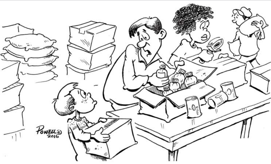
"No, we've never met the folks affected by the hurricane, but whoever they are, they're family!"